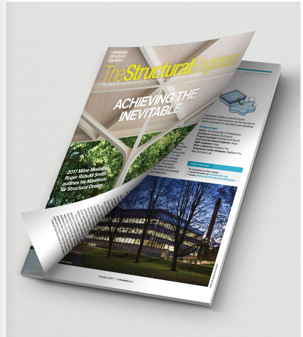
Above: The Structural Engineer magazine